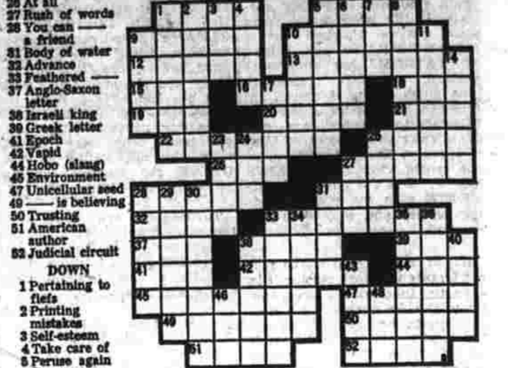
DAILY CROSSWORD PUZZLE